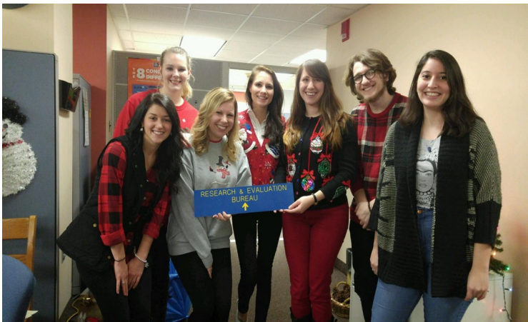
Student workers at the REB’s annual holiday party.