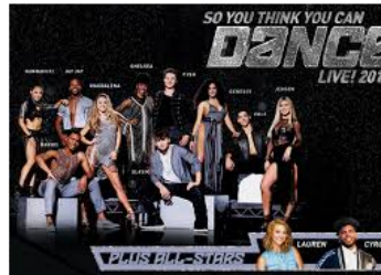
So You Think You Can Dance Live! 2018 ... mayoarts.org