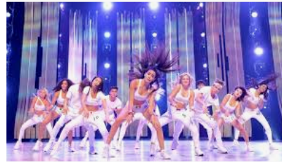
So You Think You Can Dance' Renewed for ... hollywoodreporter.com