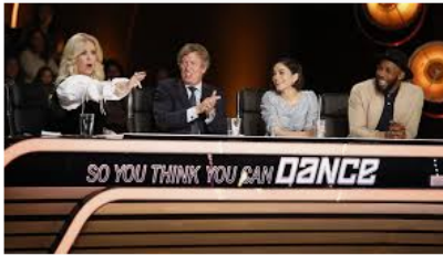
So You Think You Can Dance ... variety.com