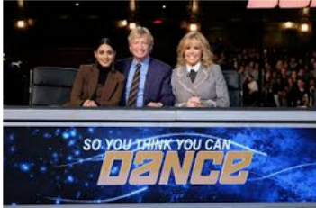
Meet the So You Think You Can Dance All ... parade.com