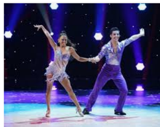
Anaheim Hills dancer will join So Yo... oeregister.com