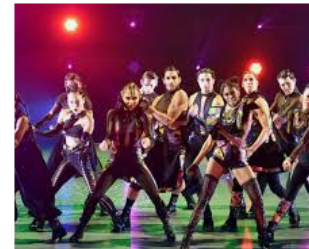
So You Think You Can Dance' Routin... decider.com