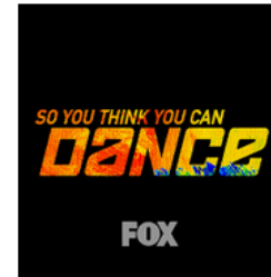
So You Think You Can Danc... facebook.com