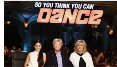
So You Think You Can Dance' Season 14 ... tvinsider.com