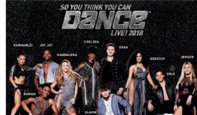
The 'So You Think You Can Dance ... clevescene.com