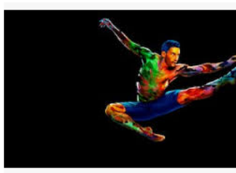
So You Think You Can Dance Auditions ... fox.com