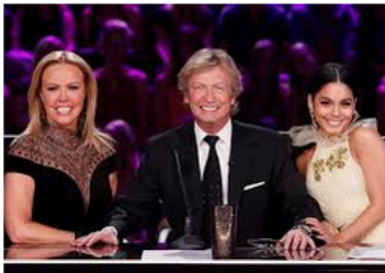
So You Think You Can Dance...