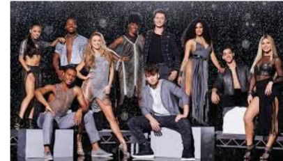
So You Think You Can Dance' Meet the ... goldderby.com