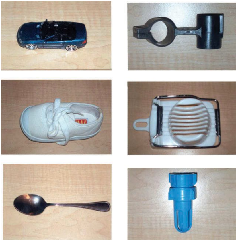
Figure 1. One set of objects used in familiarity contrast condition in Experiment 1.

After the initial matching/control experiences, the children were asked to make lexical knowledge judgments about words and objects. As children in the familiarity contrast condition performed their matching task, the familiar kinds were expected to evoke a strong feeling of familiarity and cause names and other information about themselves to be retrieved, whereas the unfamiliar kinds were expected to evoke a feeling of novelty and cause little information to be retrieved (see Figure 1). The contrast in both feeling of familiarity and amount of information generated was expected to increase the salience of these types of metacognitive experiences, and so increase the likelihood that the children would base lexical judgments about other objects upon them.