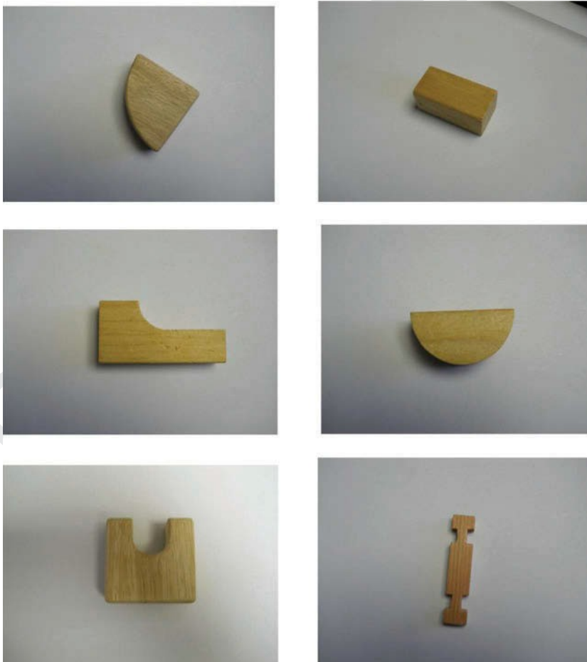
Figure 2. One set of objects used in the block matching condition in Experiment 1.

Twelve toy wooden building blocks were also obtained and divided into two sets of six (see Figure 2 for an example). Half of the children in the block matching condition performed matching tasks with one set and other half performed these tasks with the other set. Three × five inch color photographs were made of each block. 175