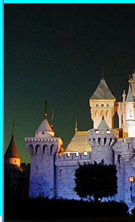
Disney Land, Los Angeles