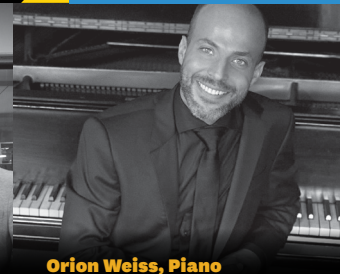
Orion Weiss, Piano