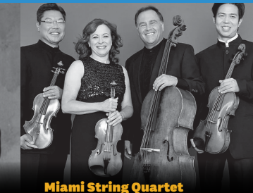
Miami String Quartet