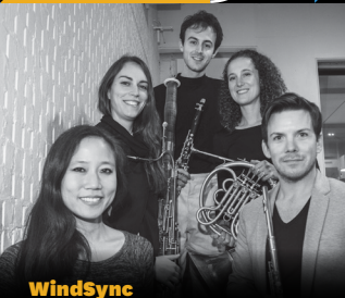
WindSync

KBMF – a partnership between The Cleveland Orchestra and Kent State University.