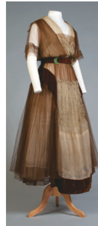
Brown tulle and velvet evening dress with silver lace American, ca. 1916 Chiffon, velvet, net