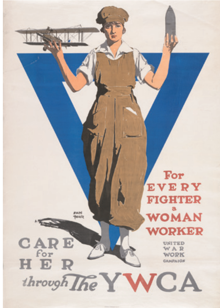
For every fighter a woman worker

The following selection of items from the exhibit (which runs through July 5, 2015) highlights several key influences that transformed how women dress—and continue to be factors in fashion today.