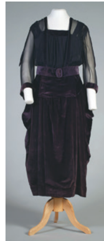
Purple velvet and chiffon dress American, 1918 Silk velvet, chiffon