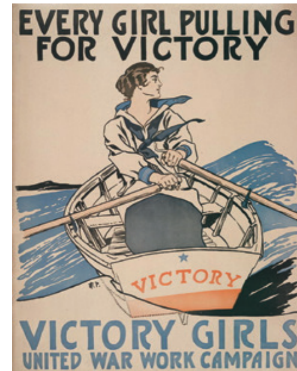
Every girl pulling for victory: Victory Girls

As women entered the workforce and joined the fight for women's suffrage, they adapted some of men's tailoring techniques and styles; throughout the 1910s women's clothing increasingly featured tailored suits. From 1912 to 1914 suits were feminine with an emphasis on the slim figure; however, in the second half of the decade, the silhouette became wider and deemphasized the waist.