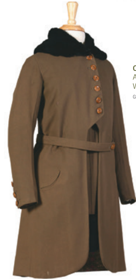
Olive wool coat with fur trim American, circa 1915

Women's sportswear also drew inspiration from nautical styles: Middy blouses worn as a part of women's gym suits were almost identical to those worn by sailors in the Navy. Elements such as sailor collars became popular not just for athletic wear, but for fashionable dresses and blouses.