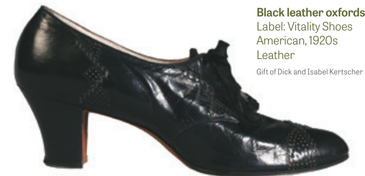
Black leather oxfords Label: Vitality Shoes American, 1920s Leather

For the first two decades of the 20th century, boots were the predominant footwear. As skirts started to rise after 1914 and the formal rules of attire relaxed, women began to wear the shorter styles with shoes and flesh-toned silk stockings, not high-button boots. In particular, lace-up oxford-style shoes replaced boots for daywear. Evening shoes continued to be pumps that were often quite plain. ⚡