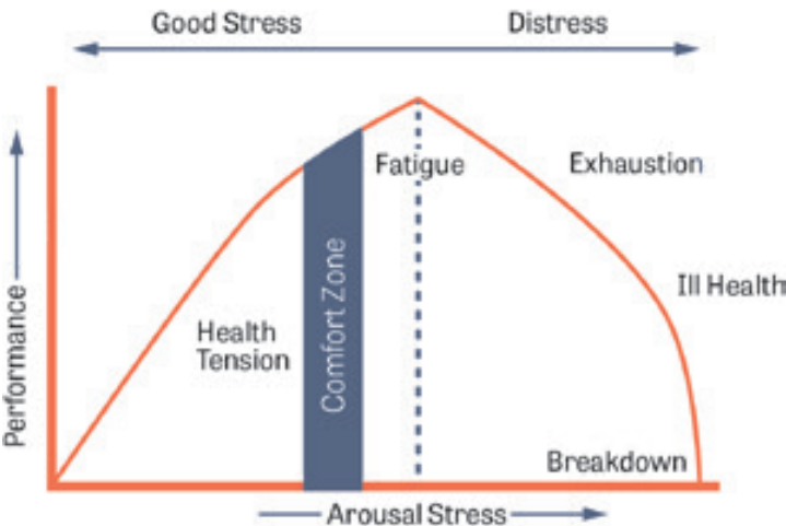
Human Function Curve

AMERICAN INSTITUTE OF STRESS, ADAPTED FROM NIXON, P: PRACTITIONER 1979