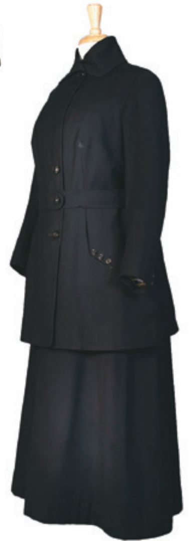
Black wool suit American, circa 1916