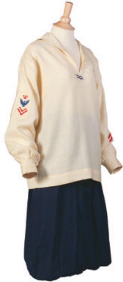
Basketball uniform American, 1914 Wool