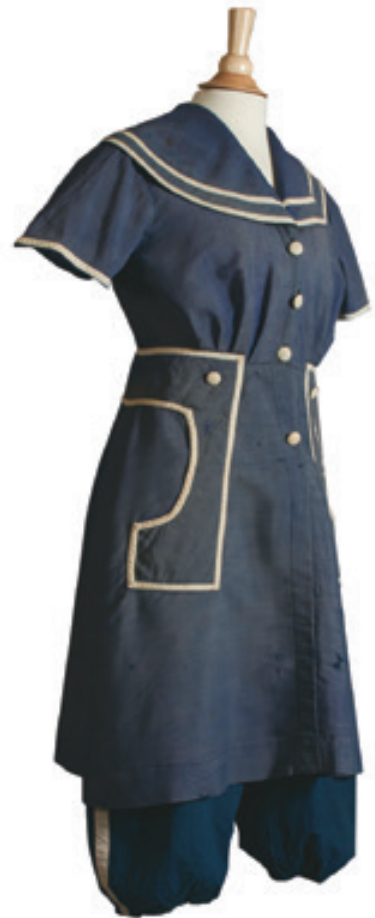
Navy blue and white swimsuit American, circa 1919 Cotton knit

Physical education for women was introduced in the mid-1800s, influenced by educational philosophies brought to America by European immigrants. Women at Smith College began playing basketball in 1892, the year after it was invented; because it was played indoors, they were permitted to wear bloomers instead of the skirts they wore for outdoor sports. Untucked middy blouses, adopted around 1910 for use in women's gym suits and basketball uniforms, created the straight, waistless silhouette that dominated women's fashion through the 1920s.