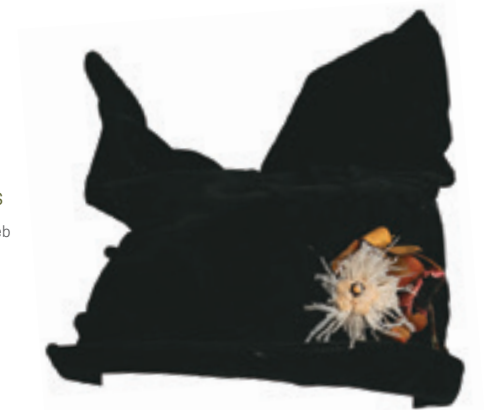
Black velvet hat with wing-like bow American, mid 1910s Velvet, artificial flowers

By the early 1920s the pompadour hairstyles popular at the turn of the century had deflated, and women began to bob their hair. As women's hairstyles became shorter, hats were designed to fit closer to the head.