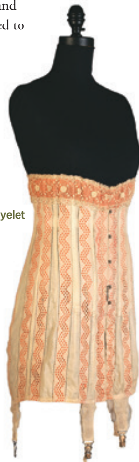
Corset of cotton eyelet American, 1914 Cotton

To achieve the slim, columnar styles fashionable between 1910 and 1914, women wore corsets that extended well down the thighs and sought to maintain a smooth, tubular shape rather than to cinch in the waist. By the early 1920s, the fashionable silhouette had broadened and clothing was sized to fit more loosely.