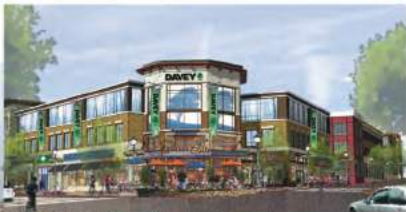
▶ An architect's concept for the proposed renovations to downtown Kent.