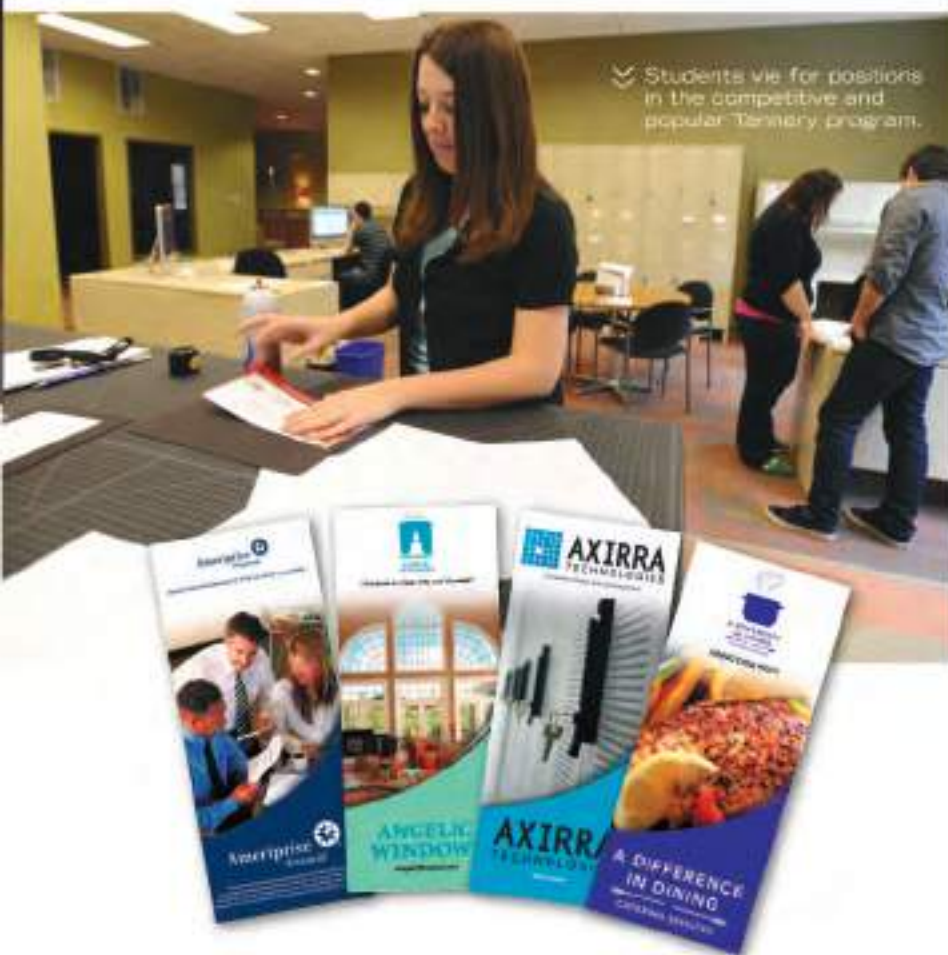
Students vie for positions in the competitive and popular Tannery program.

multimedia brand awareness programs to target-specific new product projects. Its capabilities include strategic marketing planning, market research, concepts and design for ads, brochures, direct mail, logos and identity development.