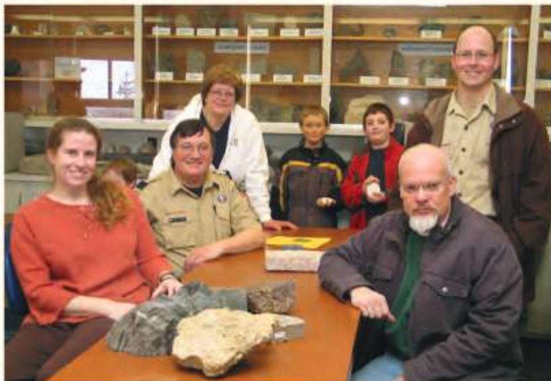
Kent State alumni and their sons visited Kent State's geology department in March. This was part of an educational experience for a group of fourth grade Cub Scouts from Aurora City Schools.