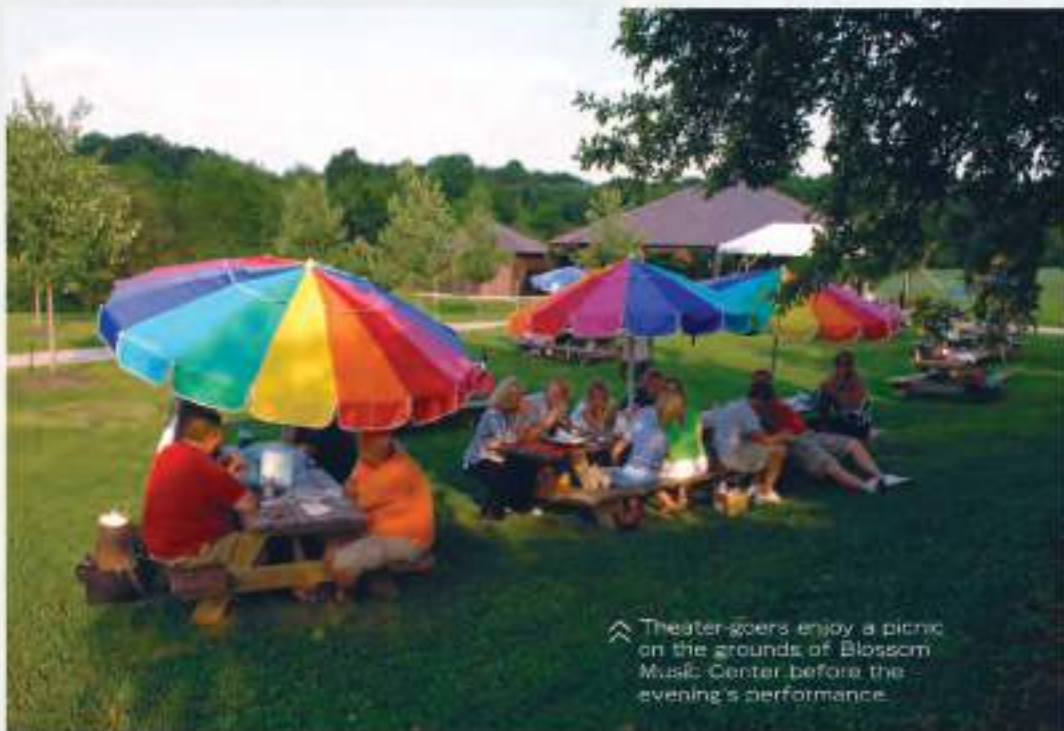
⌞ Theater-goers enjoy a picnic on the grounds of Blossom Music Center before the evening's performance.

For more information, contact Amy Morris at 330-672-8417 or amorris2@kent.edu .