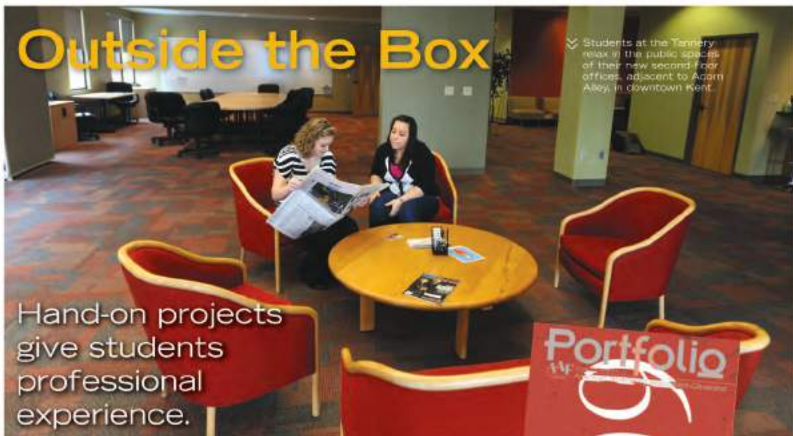
Students at the Tannery relax in the public spaces of their new second floor offices, adjacent to Acorn Alley, in downtown Kent.

Kent State University students take the initiative to gain real-world experience and demonstrate passion, compassion and professionalism in a variety of fields and settings far beyond the classroom.