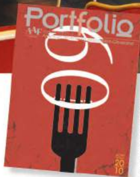
PORTFOLIO COVER

The Tannery partners with clients to build comprehensive integrated marketing communications ranging from