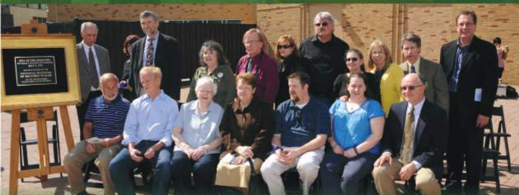
Invited guests, including family members of the slain students and several of the wounded students, pose for a photograph at the dedication of the May 4 Walking Tour. At left is the plaque acknowledging the May 4, 1970, site listing on the National Register of Historic Places.