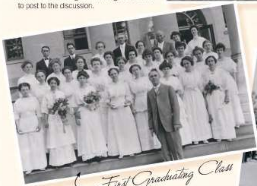
First Graduating Class