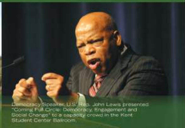
Democracy Speaker, U.S. Rep. John Lewis presented "Coming Full Circle: Democracy, Engagement and Social Change" to a capacity crowd in the Kent Student Center Ballroom.