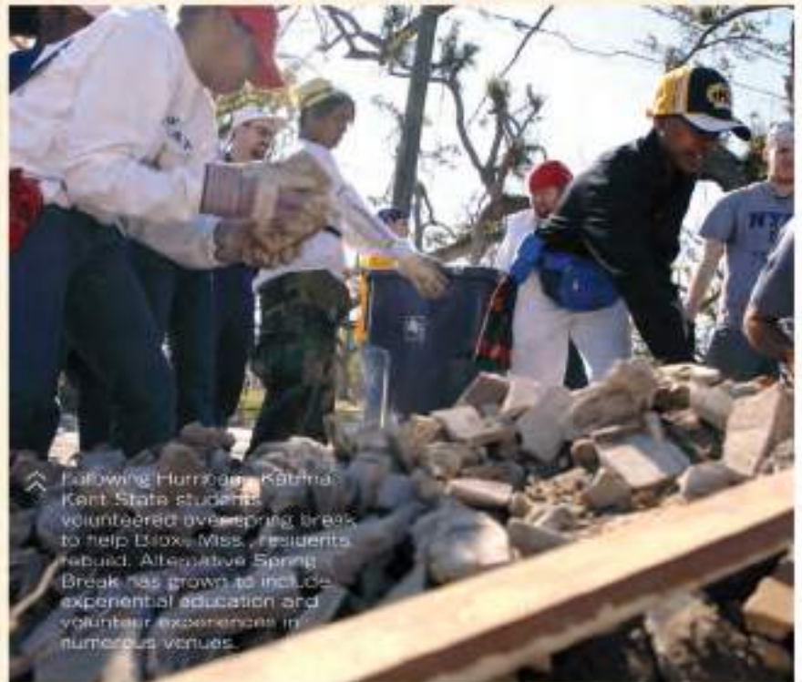
Following Hurricane Katrina, Kent State students volunteered over spring break to help Blount, Miss., residents rebuild. Alternative Spring Break has grown to include experiential education and volunteer experiences in numerous venues.

This year, nearly 70 students participated in four different trips. Students visited Spencer, W. Va., to be part of an educational and social analysis program on the Appalachian region; trekked to Washington, D.C., stayed in the nation's largest homeless shelter, and worked on projects involving poverty and environmental issues; and participated in a program aimed at helping the Native American community of Buffalo, N.Y. Closer to home, a group visited Columbiana County, Ohio, to work with community agencies to assist home owners and help with park maintenance and other activities.