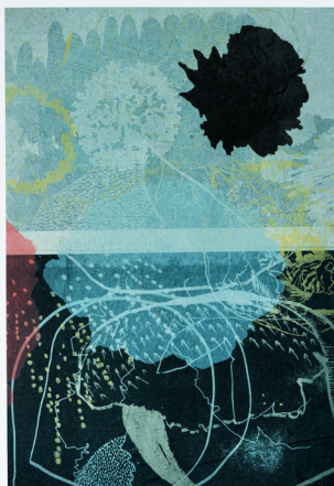
red letter year , Jillian Sokso handmade paper, relief, serigraph, and chine collé on French Paper