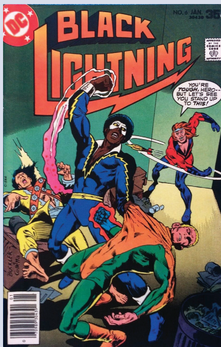
Cover of Black Lightning , Vol. 1, Issue 6 (1978)